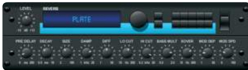
PLATE REVERB emulates the characteristics of a plate reverb chamber with control over the damping pad, modulation depth and speed, and crossover. PLATE REVERB will give your tracks the sound heard on countless hit records since the late 1950's. (Inspired by Lexicon PCM70*)

40-Input, 25-Bus Digital Rack Mixer with 16 Programmable MIDAS Preamps, USB Audio Interface and iPad/iPhone* Remote Control