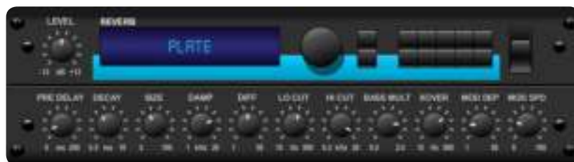
PLATE REVERB emulates the characteristics of a plate reverb chamber with control over the damping pad, modulation depth and speed, and crossover. This classic effect will give your tracks the sound heard on countless hit records since the late 1950's. (Inspired by Lexicon PCM70*)

VINTAGE ROOM stands out head and shoulders over other competing reverberation strategies in the way it models sound propagation in the air and room resonances. Invented in the early '80s, the role model delivered authentic room character from an algorithmic reverb long before convolution-based processing was available. It is an ideal reverb for mixes or sub-groups, as it adds space to complex signals – highly valued in classical music and broadcasting environments. (Inspired by Quantec QRS*)